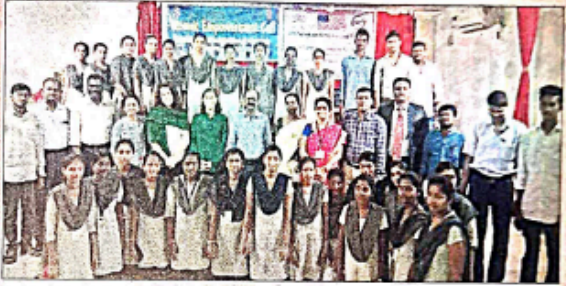
లింగవివక్ష అవగాహన సదస్సులో పాల్గొన్న అధ్యాపకులు, విద్యార్థులు